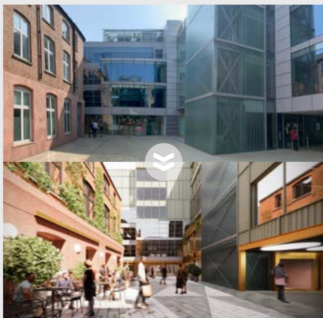
Times House & Laundry Building - Before & After

We have also held one-to-one meetings with residents, and will continue to evolve our designs as we hear more from you.